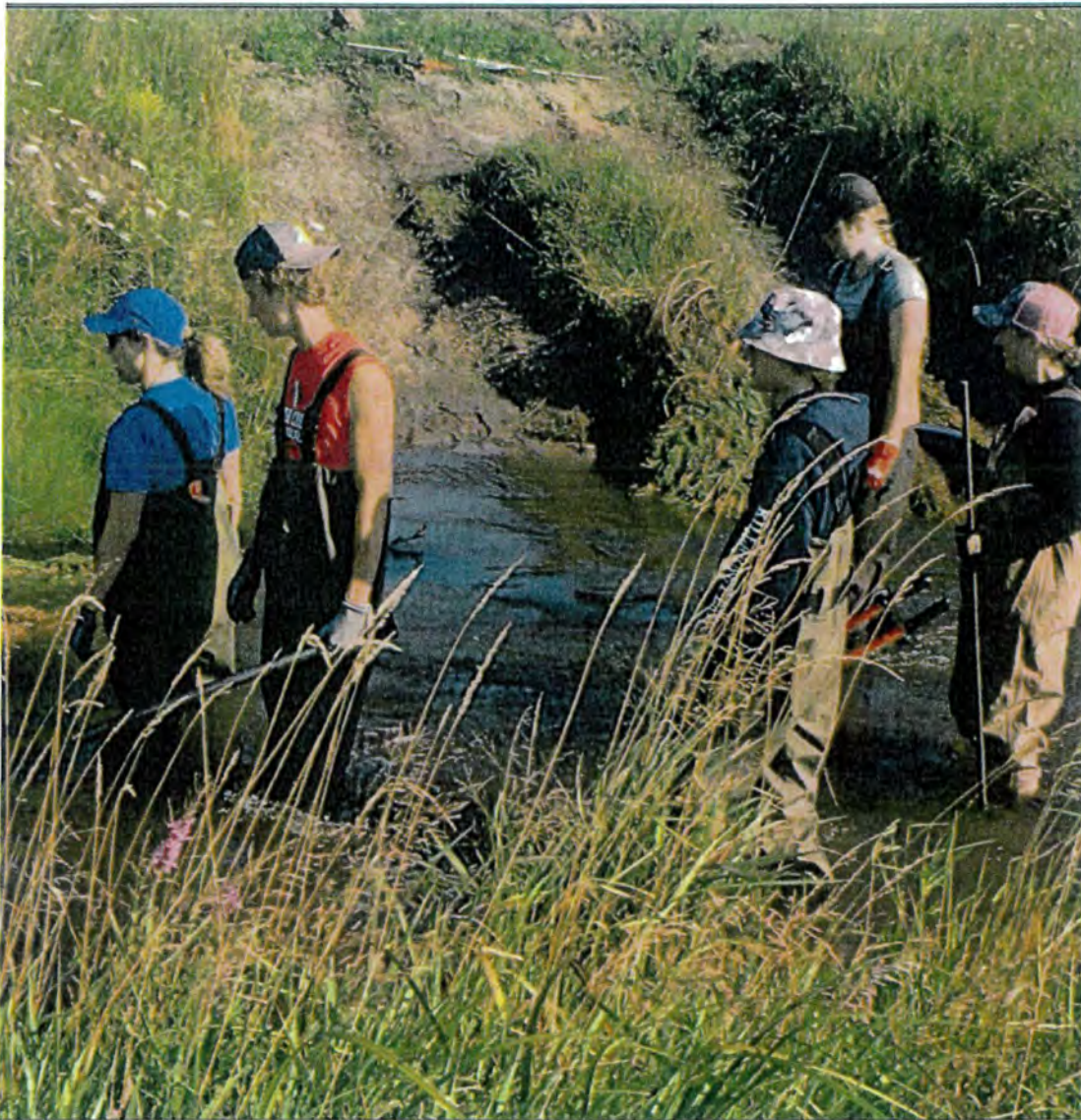
Community Volunteers, working in-stream, installing tree revetments for erosion control – August 2023

The South Simcoe Stream Network program is busy planning our fall events. On the agenda are the planting of 500 trees along Sheldon Creek in Adjala-Tosorontio, to provide new forest coverage on stream banks that have been restored, over the summer, to reduce erosion and provide fish and wildlife habitat. We will also be undertaking another stage of stream restoration on Beeton Creek in the town of Beeton, where, using cut trees anchored into the