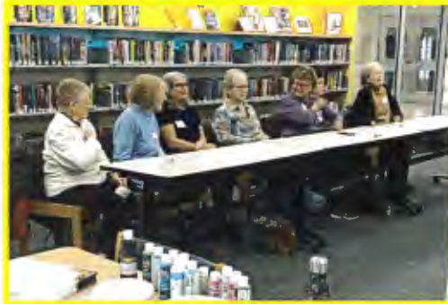
Seniors' Mindfulness and Meditation Workshop at Angus Branch