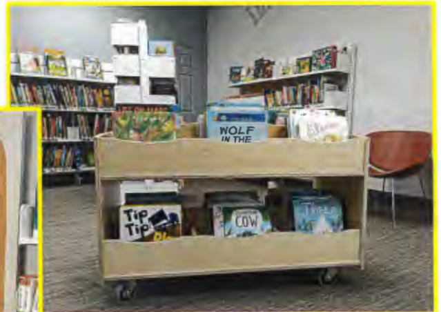
A new bright space for kids is revealed.