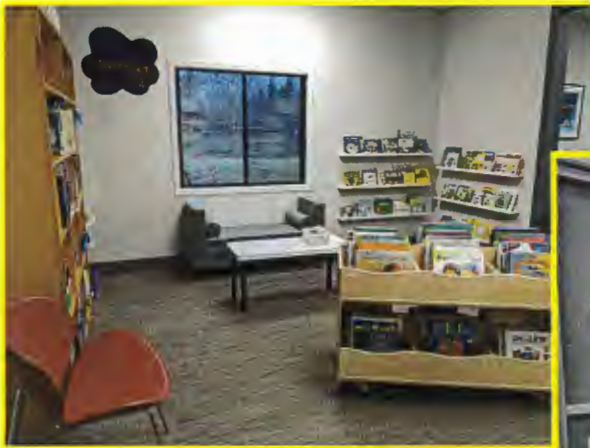
Thornton Branch 2023: