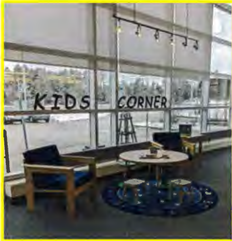
Angus Branch features an inviting spot for families and children in the Kids' Corner.