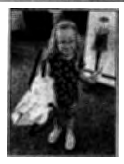
One lucky winner in the Summer Reading Club -Thornton Branch.