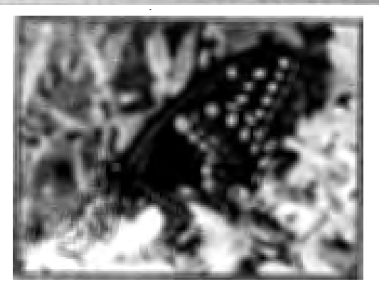
"Blossom" our Black Swallowtail emerges to enjoy our Community Garden